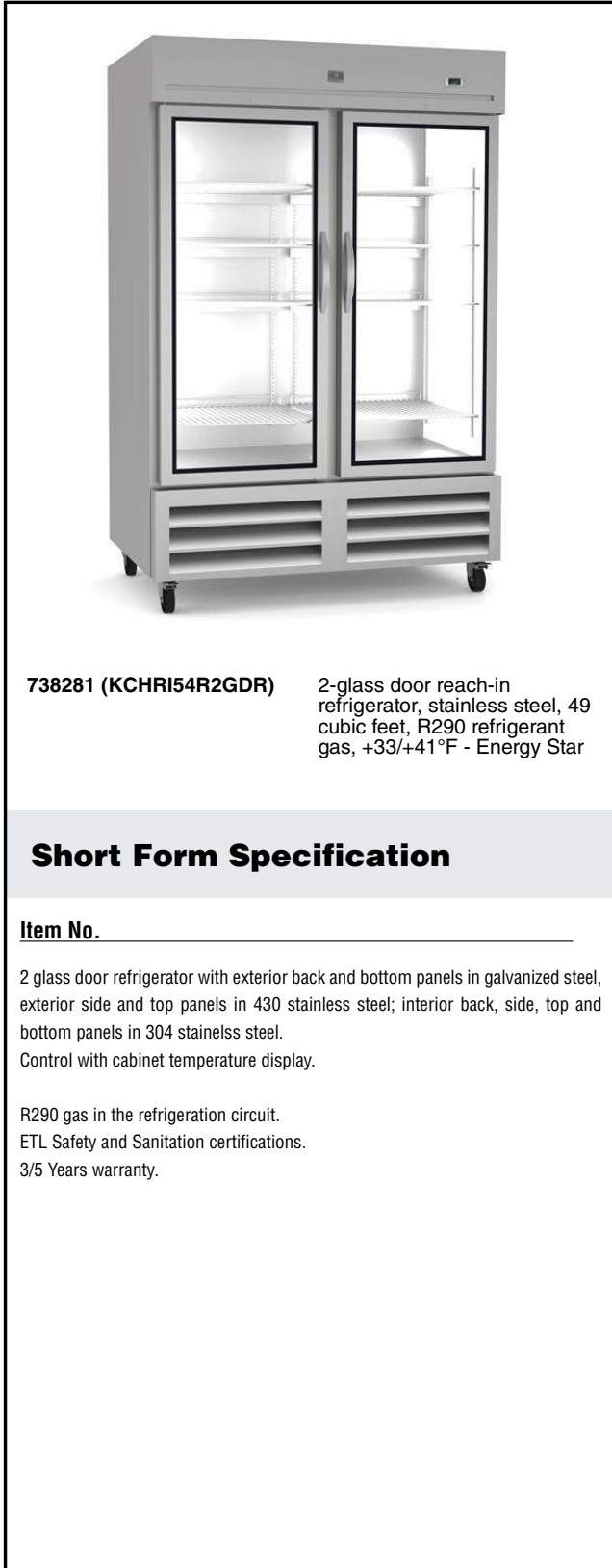
738281 (KCHRI54R2GDR) 2-glass door reach-in refrigerator, stainless steel, 49 cubic feet, R290 refrigerant gas, +33/+41°F - Energy Star