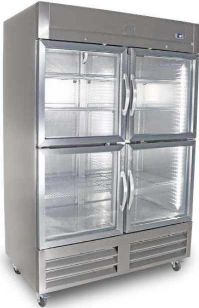
738316 (KCHRI54R4HGDR) 4 Half Glass Door Refrigerator 49 CU.FT +33/+41°F S/S R290