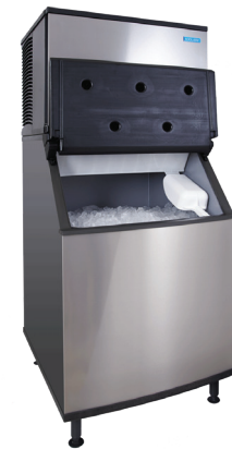
Pictured: Koolaire Kuber KT0700 series on a K570 bin