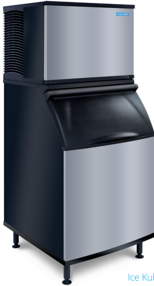
Koolaire KT-0500 Ice Kube Machine on K570 Bin

Koolaire by Manitowoc ice machines are designed, developed and tested by Manitowoc engineers to provide great ice production, energy efficiency and reliable service at an affordable price.