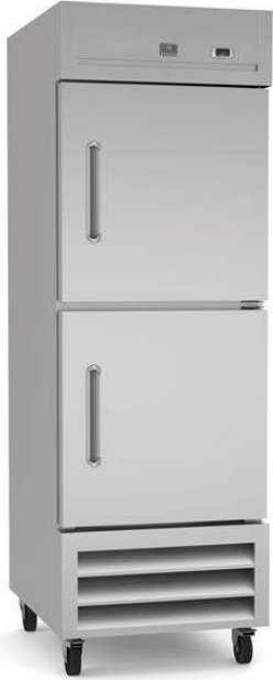
738285 (KCHRI27R2HDF) 2-half door reach-in freezer, stainless steel, 23 cubic feet, R290 refrigerant gas, -9°F