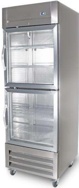
738317 (KCHRI27R2HGDR) 2 Half Glass Door Refrigerator 23 CU.FT +33/+41°F S/S R290