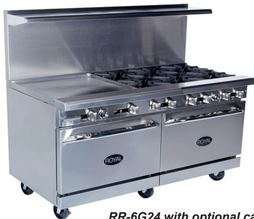
RR-6G24 with optional casters

Models: RR-10 RR-8G12 RR-6G24 RR-4G36 RR-2G48 RR-G60 RR-6RG24 RR-8GT12 RR-6GT24 RR-4GT36 RR-2GT48 RR-GT60